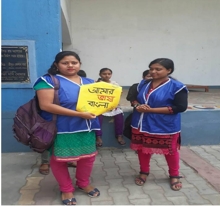
Distributing food and stationary on Childrens day Health Awareness camp at Nibedita Colony