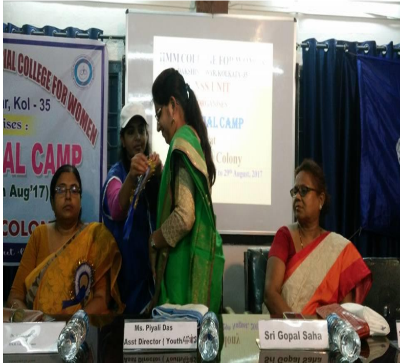
School Literacy Programme Swacchata Programme