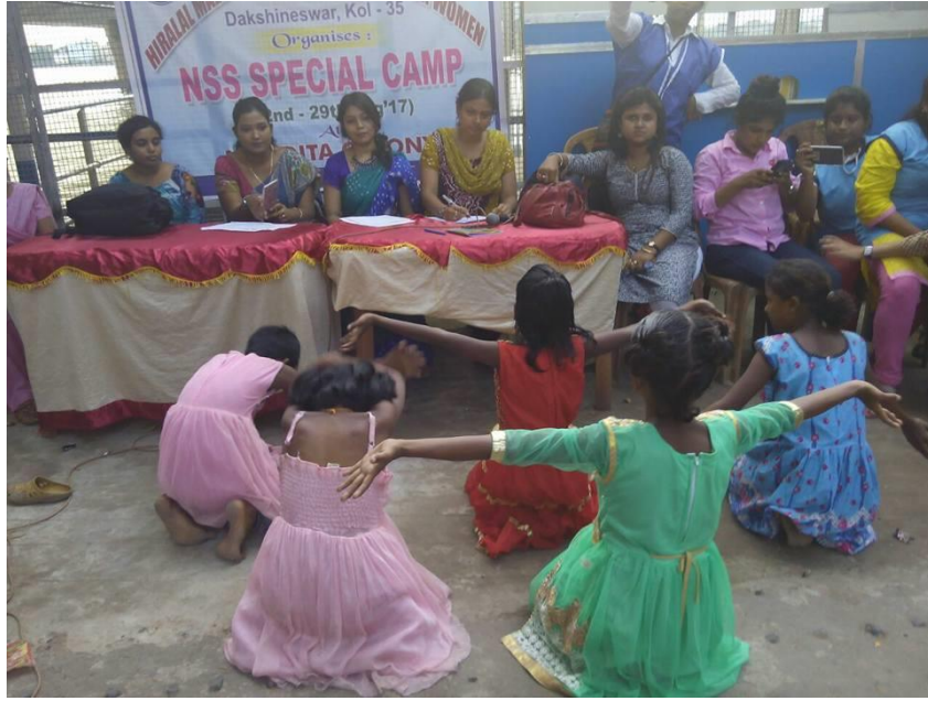
Drawing Competition NSS Spl Camp Cultural Programme at NSS Special Camp