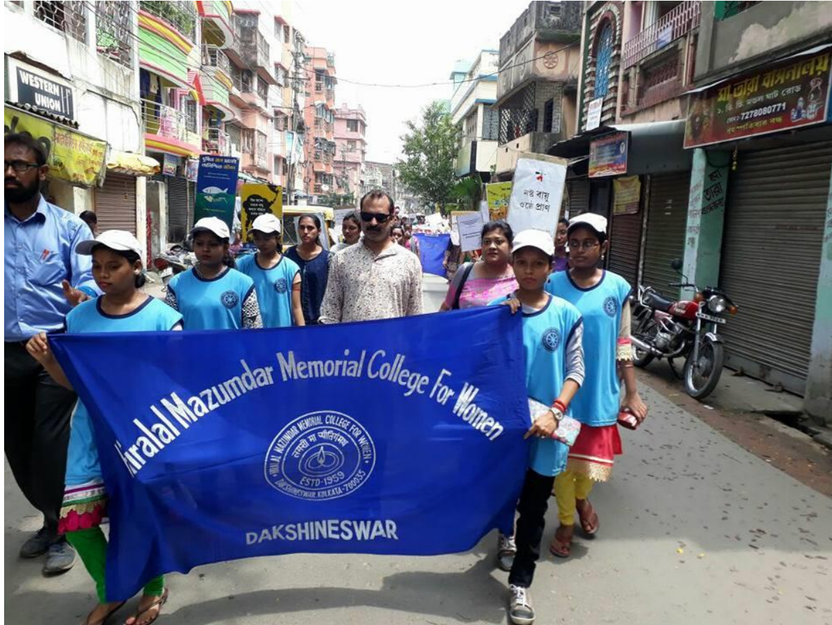
5 days workshop at WBSU Environment Awareness Rally