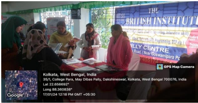
Kolkata, West Bengal, India 35/1, College Para, May Dibas Pally, Dakshineswar, Kolkata, West Bengal 700076, India Lat 22.656692° Long 88.360838° 17/01/24 12:18 PM GMT +05:30