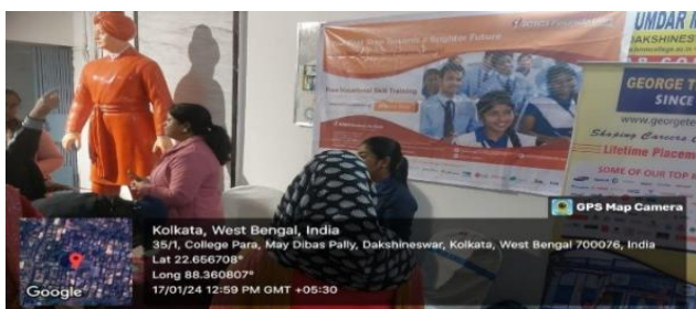
Kolkata, West Bengal, India 35/1, College Para, May Dibas Pally, Dakshineswar, Kolkata, West Bengal 700076, India Lat 22.656708° Long 88.360807° 17/01/24 12:59 PM GMT +05:30