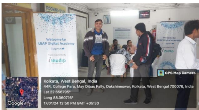
Kolkata, West Bengal, India 44R, College Para, May Dibas Pally, Dakshineswar, Kolkata, West Bengal 700076, India Lat 22.656795° Long 88.360716° 17/01/24 12:50 PM GMT +05:30