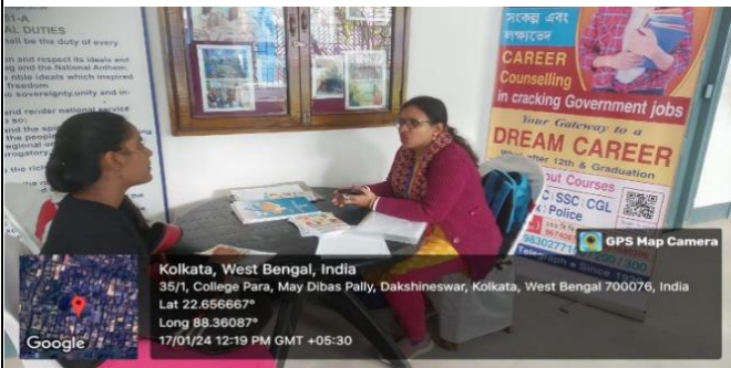
Kolkata, West Bengal, India 35/1, College Para, May Dibas Pally, Dakshineswar, Kolkata, West Bengal 700076, India Lat 22.65667° Long 88.36087° 17/01/24 12:19 PM GMT +05:30