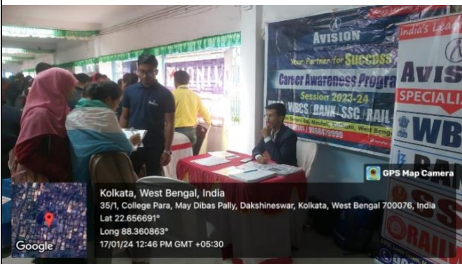
Kolkata, West Bengal, India 35/1, College Para, May Dibas Pally, Dakshineswar, Kolkata, West Bengal 700076, India Lat 22.656691° Long 88.360863° 17/01/24 12:46 PM GMT +05:30