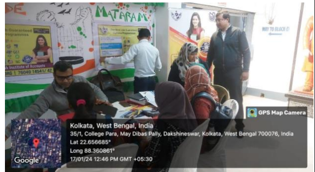
Kolkata, West Bengal, India 35/1, College Para, May Dibas Pally, Dakshineswar, Kolkata, West Bengal 700076, India Lat 22.656685° Long 88.360861° 17/01/24 12:46 PM GMT +05:30