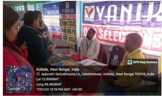
Kolkata, West Bengal, India 17, Jadunath Sarbobhouma Ln, Dakshineswar, Kolkata, West Bengal 700016, India Lat 22.656684° Long 88.360804° 17/01/24 12:19 PM GMT +05:30