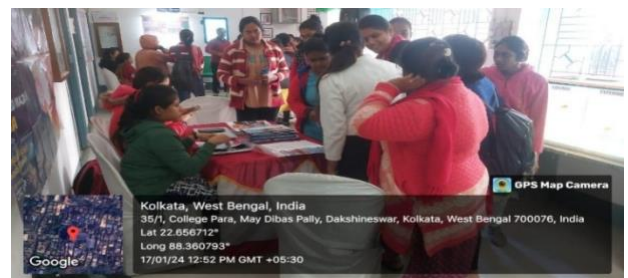
Kolkata, West Bengal, India 35/1, College Para, May Dibas Pally, Dakshineswar, Kolkata, West Bengal 700076, India Lat 22.656712° Long 88.360793° 17/01/24 12:52 PM GMT +05:30