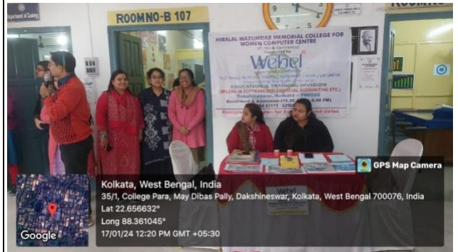
Kolkata, West Bengal, India 35/1, College Para, May Dibas Pally, Dakshineswar, Kolkata, West Bengal 700076, India Lat 22.656632° Long 88.361045° 17/01/24 12:20 PM GMT +05:30