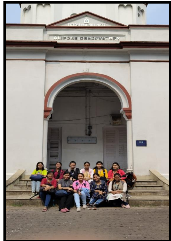
Glimpses of Some Moments During Visit